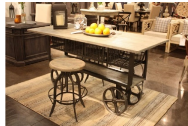
Fig. 3. Steampunk furniture

Lighting in a steampunk interior plays a very important role. The light should pour from different sources - softly, diffusely and slightly muffled, imitating the reflections of gas burners and candles. Metal is also a favorite among other materials here. However, the brutality of structures made from bent pipes or rods can be combined with the gloss of luxurious Versailles-style chandeliers and the comfort of fabric lampshades. It is important that all lighting items have the features of antique products, emphasizing the historical and semantic orientation of the style. The decor in steampunk design places the right accents that convey the main concept of this direction: an incredible mixture of orthodox classics and scientific and technological progress. But still, we should not forget that this style corresponds to the ideas of science fiction writers of the 19th century, so the attributes of researchers of that time would be very appropriate: a microscope, a wooden globe, an old map or a sextant. And the ideal way to harmoniously combine rare features and modernity are metal figurines and 3D paintings.