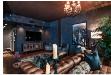
Fig. 2. Materials in steampunk

Furniture covered with genuine leather most accurately conveys the character of a Victorian interior, which is the backdrop for industrial steampunk decor. Massive comfortable sofas, soft chairs with a bent wooden base, respectable armchairs with high backs and soft armrests are the ideal setting for this style. When skillfully combined with leather design elements, soft upholstery made from natural fabrics can also be used, usually in harmony with the color of curtains and carpets. Hard furniture is also often covered in leather, decorated with rivets and metal decor. Solids of noble wood in brown and beige tones with copper and brass details are often used to make cabinet furniture, as well as kitchens (fig. 3).