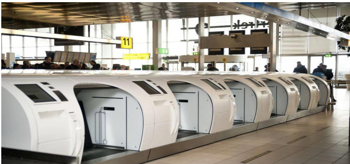
Fig. 2.2. The walls of independent baggage check-in

There are also the walls of independent baggage registration (Fig. 2.2), which are installed on already existing regular check-in desks at the airport, which allows to deprive the airport of expensive investments and significant changes in the airport infrastructure. This counter can be supplemented by equipment for passenger registration and excess baggage payment.