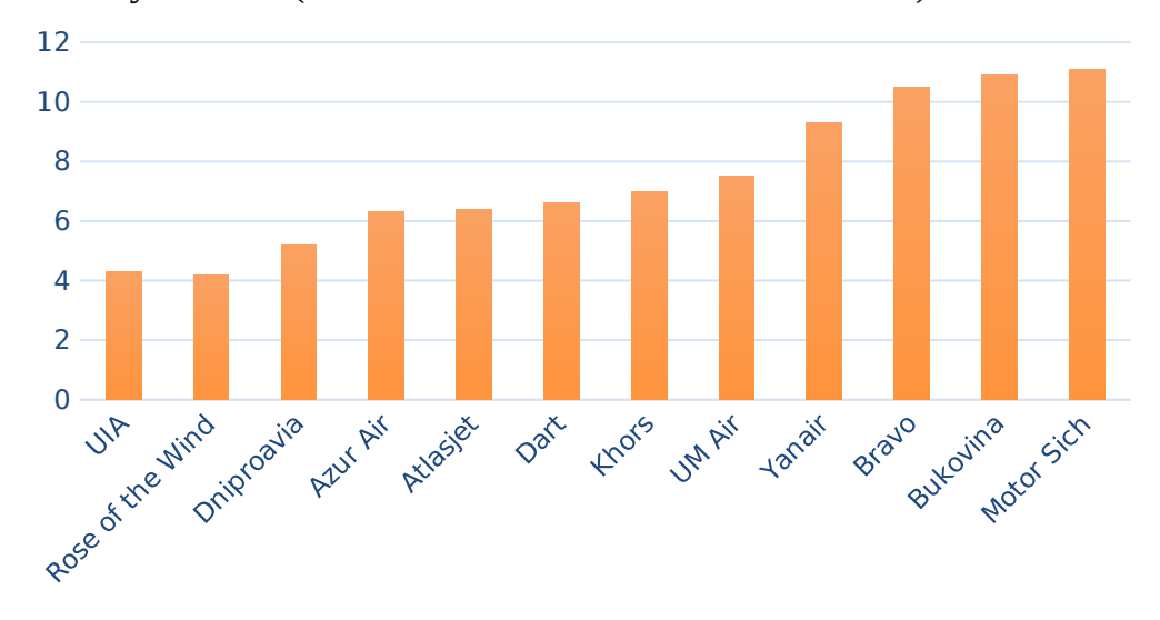
Figure 1. Age of Ukrainian fleet

The average age of the aircraft fleet of Ukrainian airlines is approaching 19 years and is currently 18,46 years old. The statistics may be observed at the Figures 1-2. The data were obtained by analyzing information from the register of Ukrainian civil aircraft on 94 aircraft of 12 Ukrainian airlines. The youngest aircraft with Ukrainian registration is 2 months old (Boeing 737-800 UR - PSR UIA - July 2016), the oldest is 50 years old (An-12B UR-11819 Motor Sich 1966).