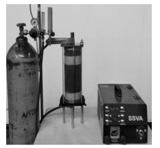
Figure 3. High-temperature unit for thermal treatment of carbon materials by TMEC

To perform the thermal purification of charcoal, a laboratory high-temperature furnace was used (Fig. 3).