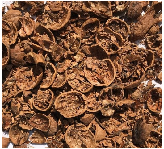
Figure 1. Images of the original walnut shells