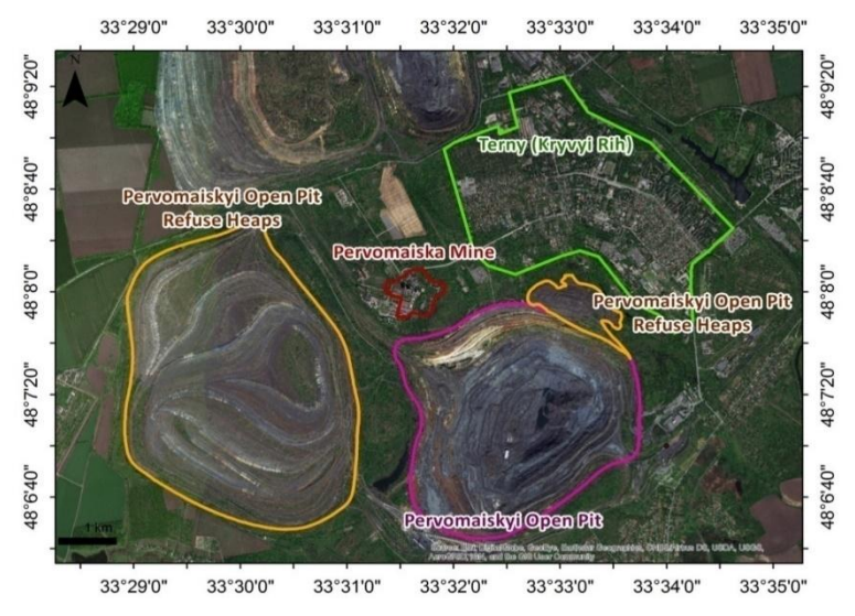
Fig. 2. Location of the Pervomaiske deposit in the outskirts of the Kryvyj Rih city

At the Pervomaiske deposit, uranium mineralization was completely localized in commercial iron ores. It was found out that the ores had a carbonate-hematitemagnetite composition having interspersed uranium minerals. Therefore, these iron ores are simultaneously classified as uranium. Their composition is relatively simple: iron ore minerals (30...75%), carbonates and silicates (20...70%).