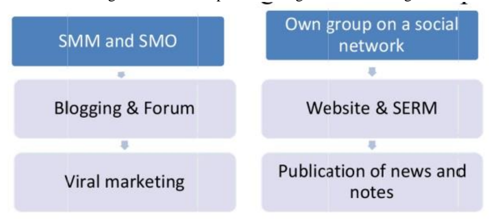
Fig. 1. The most popular tools of network PR

The more honest the PR tools in the network, the longer-lasting the effect will be, and honest methods of attracting customers will provide a huge audience of regular customers.